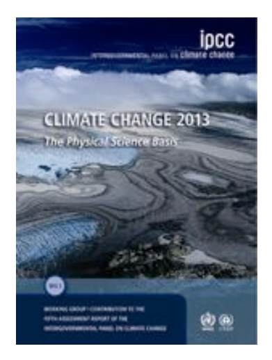
Intergovernmental Panel on Climate Change Fifth Assessment Report 2013 http://www.ipcc.ch/report/ar5 /wg1/#.UnCtJxyPgao

contribute to the program. Initially, Jesuit Social Services (Australia) and Environmental Science for Social Change (ESSC) are setting up a charging system within their existing projects/programs to facilitate F3 contribution. Aside from this, the Ecology team is doing an active follow up with those Provinces who have initially expressed their interest of support: Australia, Indonesia and Micronesia, and strategize on how we may assist in the set up of F3 system within the province. Aside from this, there are few schools in Australia and individuals in Canada who have also expressed their interest to support, which the team is initiating communications. A contribution record and update on the activity supported by F3 fund shall be reported first quarter of 2014.