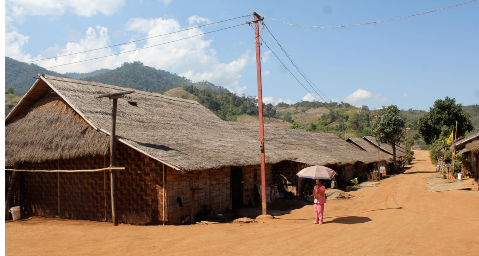
Around 600 Shan refugees live in Kung Jor Camp.