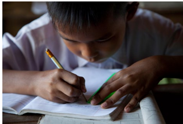
Cover Photo: A child studies in a learning centre for children of Burmese economic migrants in Ranong, Thailand.