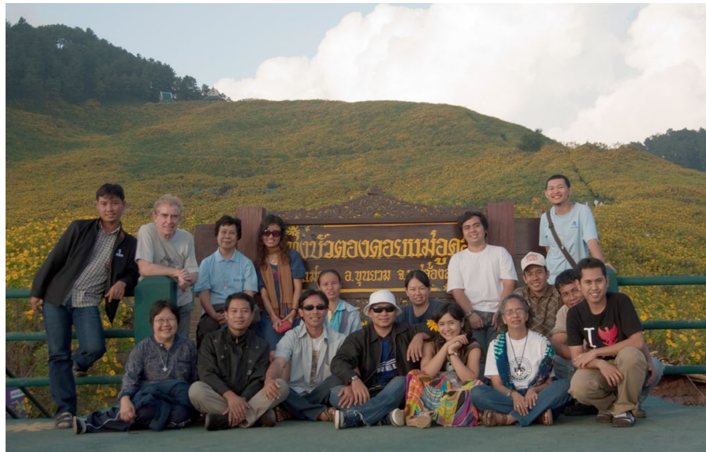
Mae Hong Son project staff.

Although JRS had its official birth in 1980, Jesuits had been involved in refugee and displaced ministry from the start of their history. Saint Ignatius, their founder, had attracted the attention of the Dominican Inquisition in Spain: his teachings to them seemed dangerously heretical, and they claimed Ignatius was a refugee in Rome fleeing from their investigations. After their arrival in Rome in 1537 the early companions of Ignatius were confronted with a severe famine and harsh winter such that many people fled to Rome for help, and among them were the sick and dying. Ignatius was given the use of a house where initially 400 were cared for, but this number later grew to over 3000. All this while the companions were going through the discernment exercise