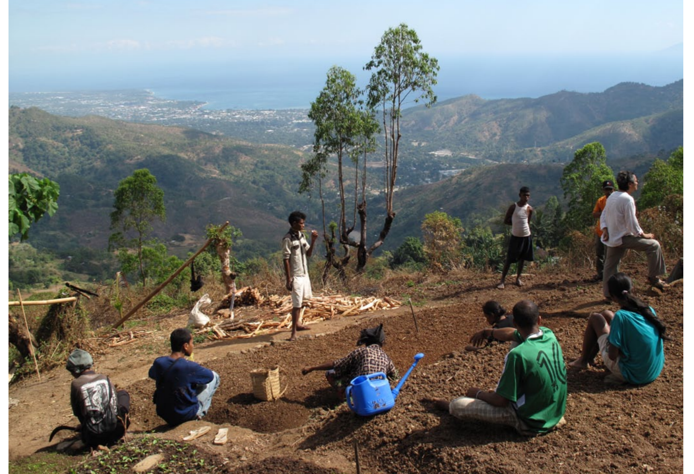
A vegetable garden of a group of households JRS is assisting with seeds and training after they were reintegrated into communities after conflict caused displacement in Timor Leste.

Oliver White, regional advocacy and communications officer