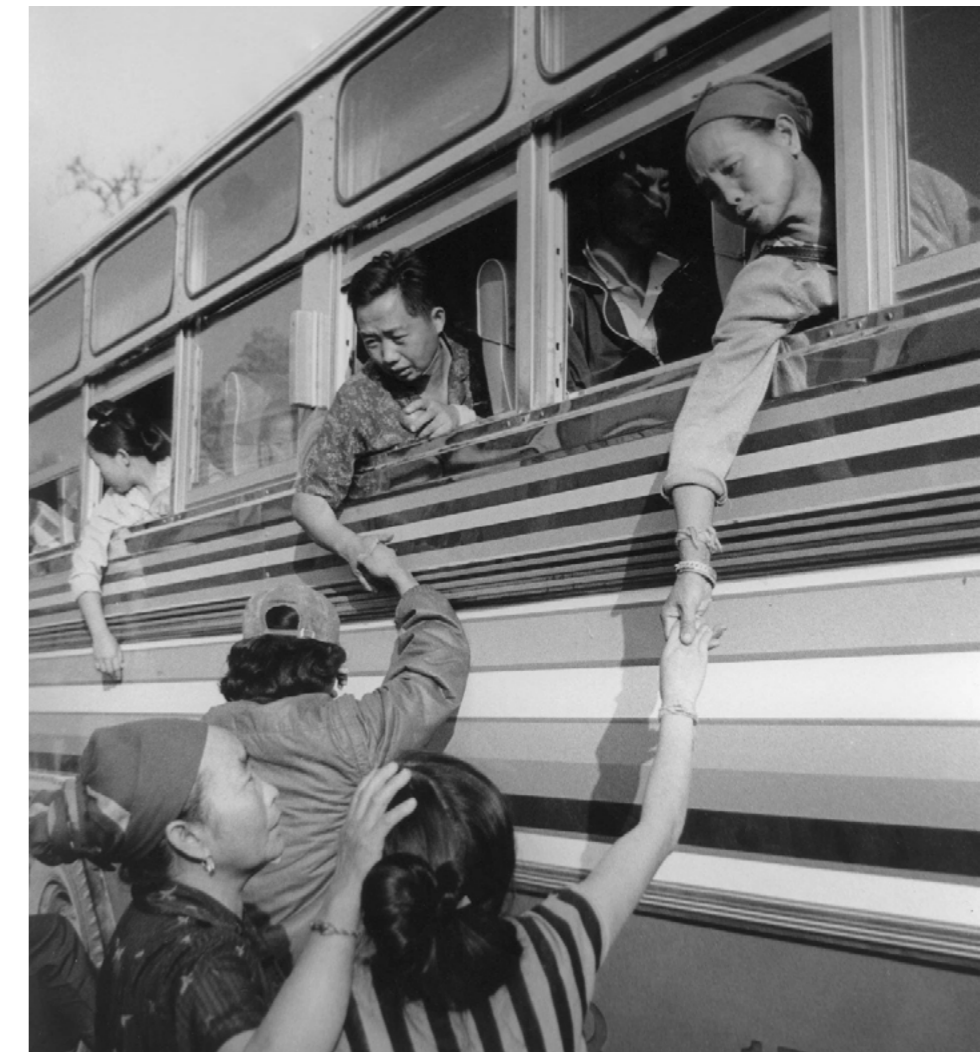
Top JRS staff celebrate 30 years at Xavier Hall in Bangkok. Above families leave refugee camps to return home.