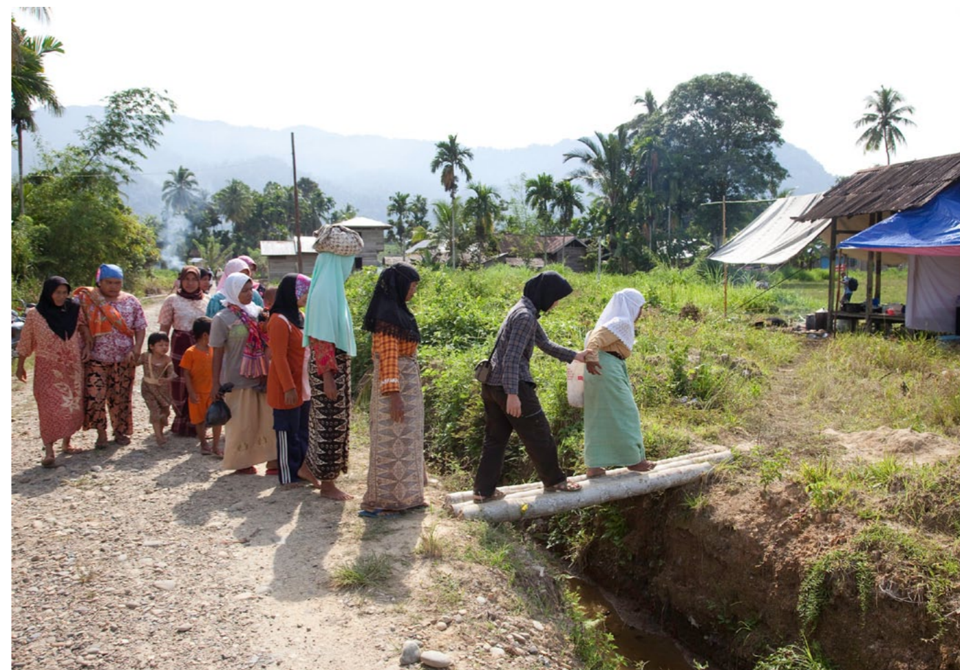
JRS is involved in teaching disaster preparedness in Aceh Indonesia.

There is an activity called Jumpa Kangen (longing to meet) or reunification which was facilitated by UNHCR in the Free Zone area between Batu Gede and Mota Ain. This activity enabled separated families to see each other again even though just briefly. Some of these Jumpa Kangen were followed up with reconciliation meetings and reciprocal visits by both delegates of refugees and their countrymen and women from East Timor. This finally initiated a repatriation process that JRS was actively involved in. There is one