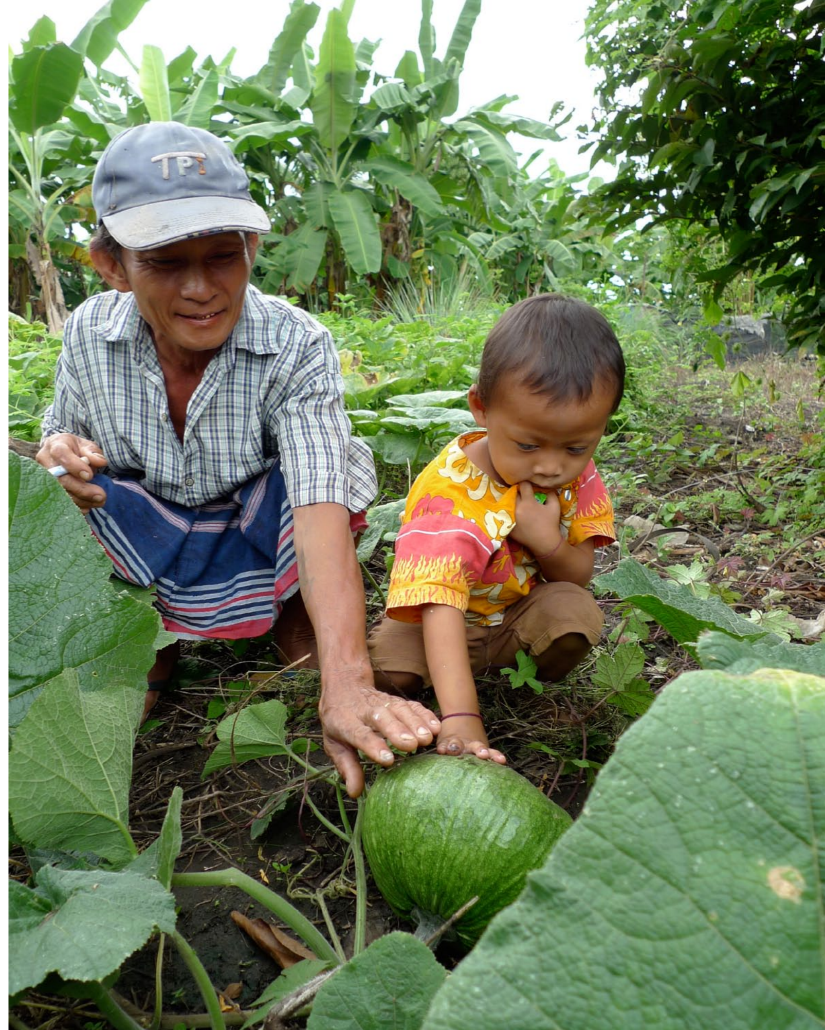
A Burmese refugee displays the fruits of his labour. JRS supplies families with seeds to grow gradens, like this pumpkin garden in Mae Sot.