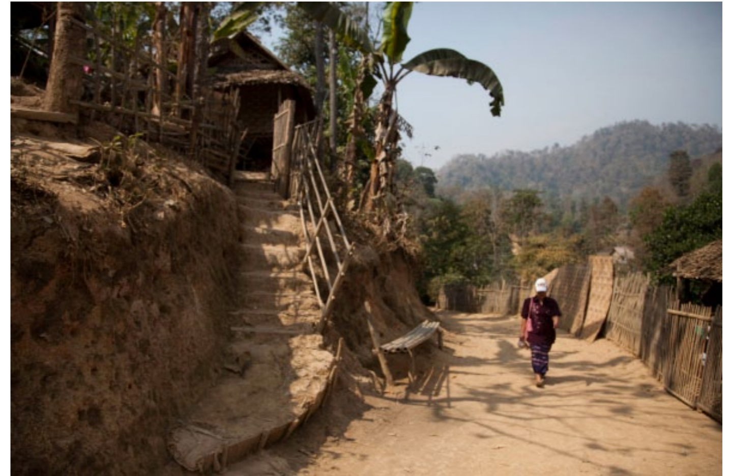
A woman walks up one of the many dusty hills of the Ban Mai Nai Soi Camp in Mae Hong Son.

Besides the managerial work we also joined the special feast days celebrated in the camp like Christmas, Easter, the Feast of the Immaculate Conception and the Feast of the Nativity of Mary