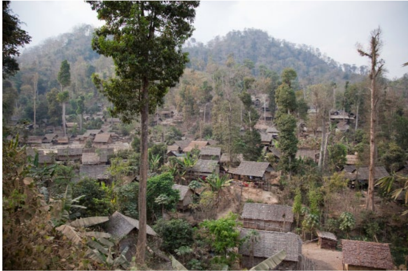
View from the high school onto the homes in Ban Mai Nai Soi Camp in Mae Hong Son. This camp now holds over 18,000 people.