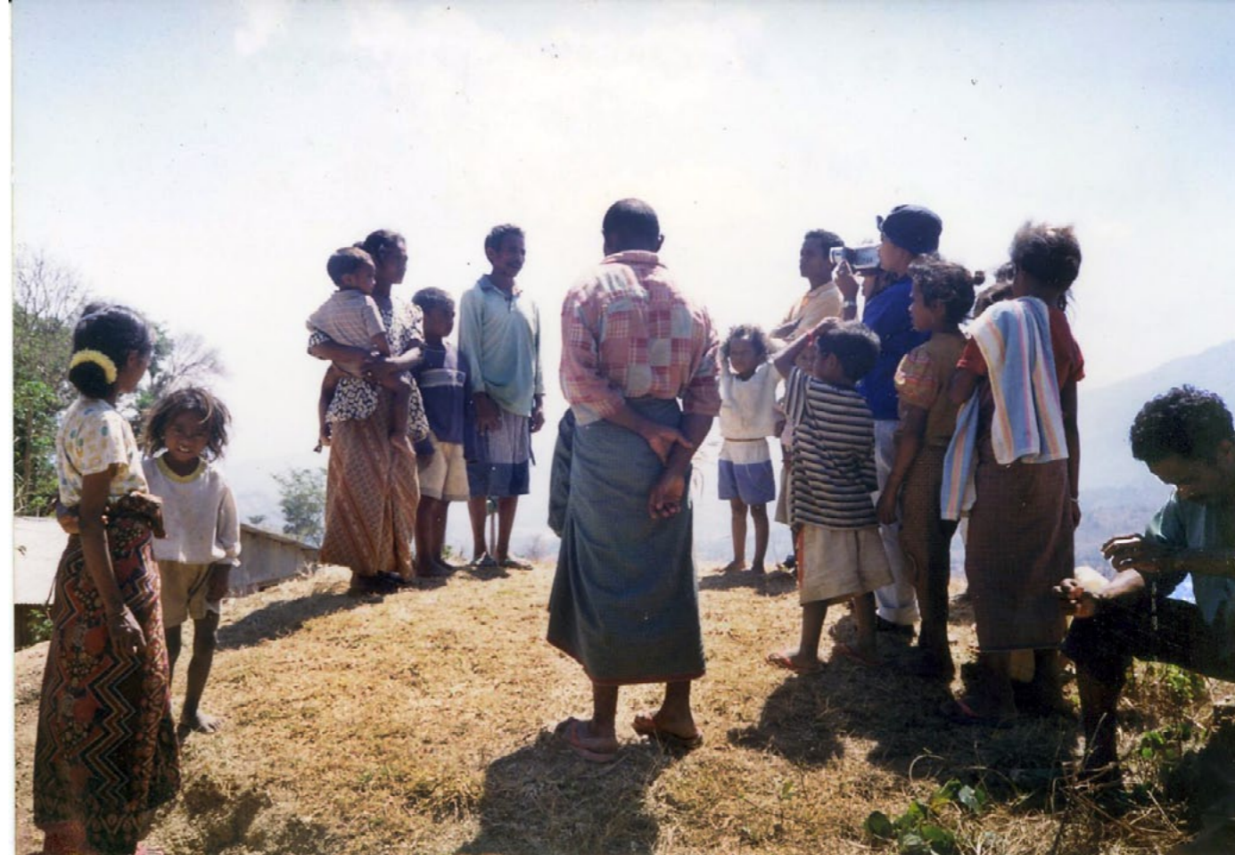
Atambua, West Timor, Indonesia during a video message recording for relatives in East Timor. Many people moved across the border between Indonesia and Timor Leste after violent retaliations of pro Autonomy supporters against the Independence votes.

Lars Stenger, national advocacy officer JRS Indonesia