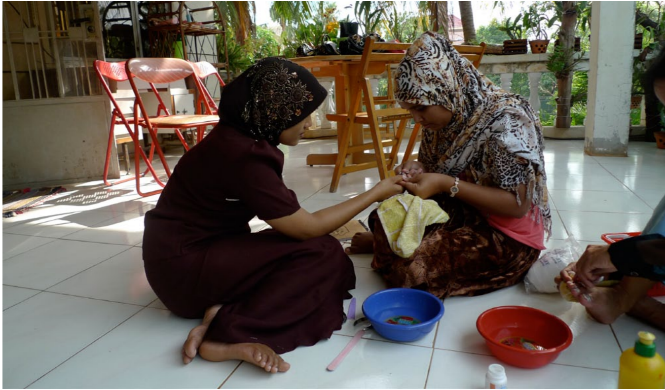
A group of Vietnamese women form an informal support group to combat isolation in Phnom Penn.