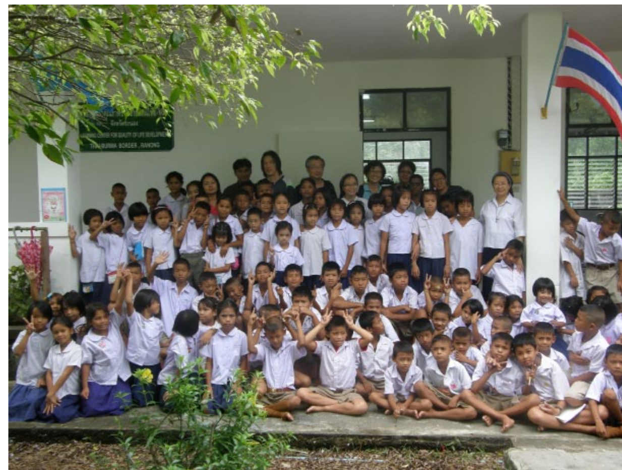
Representatives from JRS Singapore visit the Ranong project.