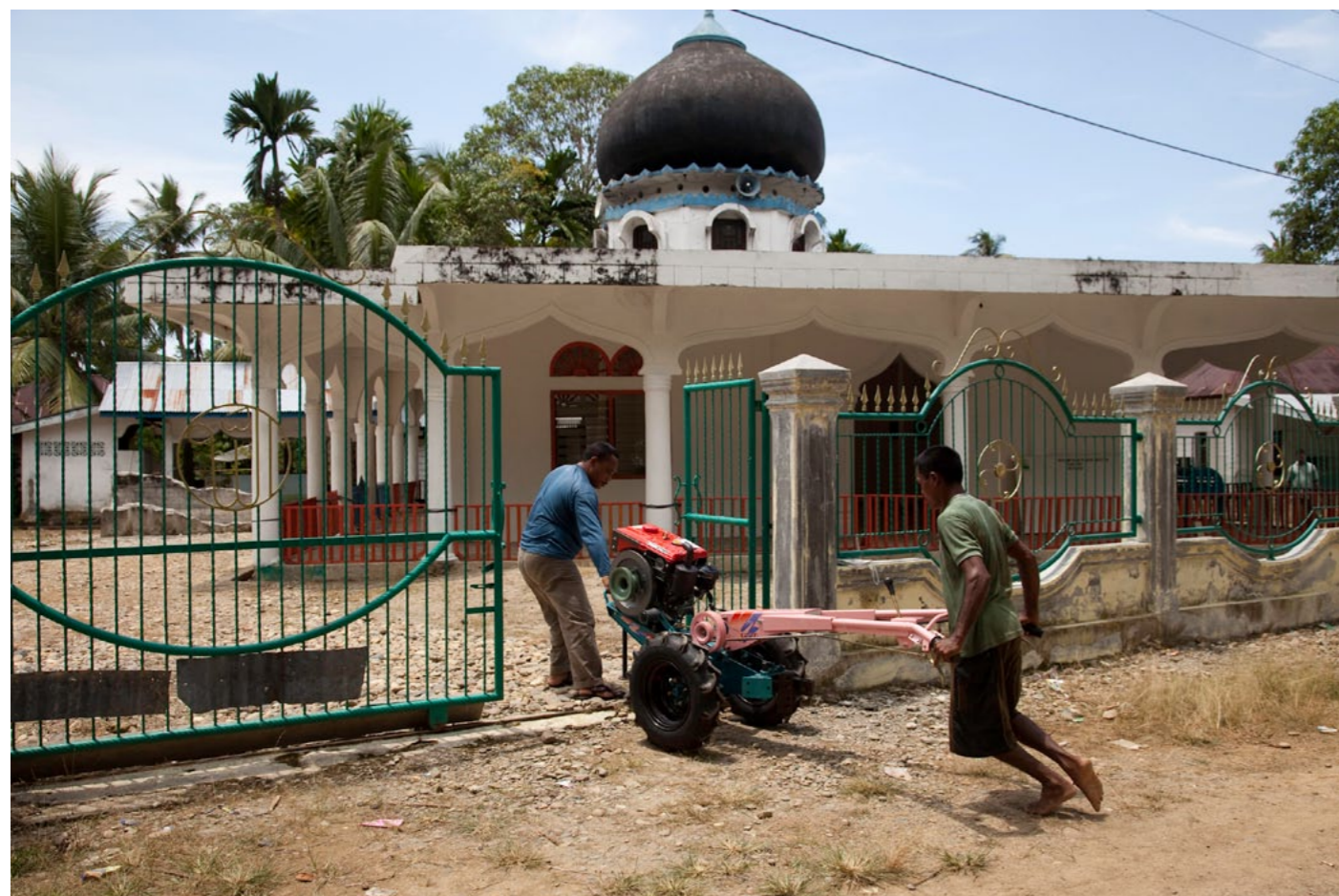
Two men in Aceh carry one of two JRS-donated tractors to a blessing ceremony.

This wave of refugees started to decrease when troops from Australia closed all borders and controlled the security of East Timor. The largest impact from this closure was the disruption of information between Timor Leste refugees in West Timor and their countrymen in East Timor. I admit I got goose bumps when I saw lines of tanks and armored vehicles at the border. However, it turned out that I actually had to frequently pass them to carry out our task with other JRS team members.