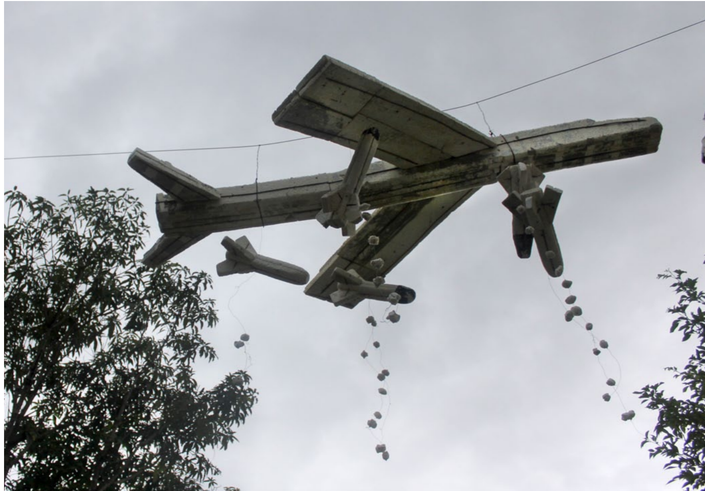
A sculpture of a plane dropping cluster bombs hangs at the Meta Karuna reflection centre in Siem Reap, Cambodia.