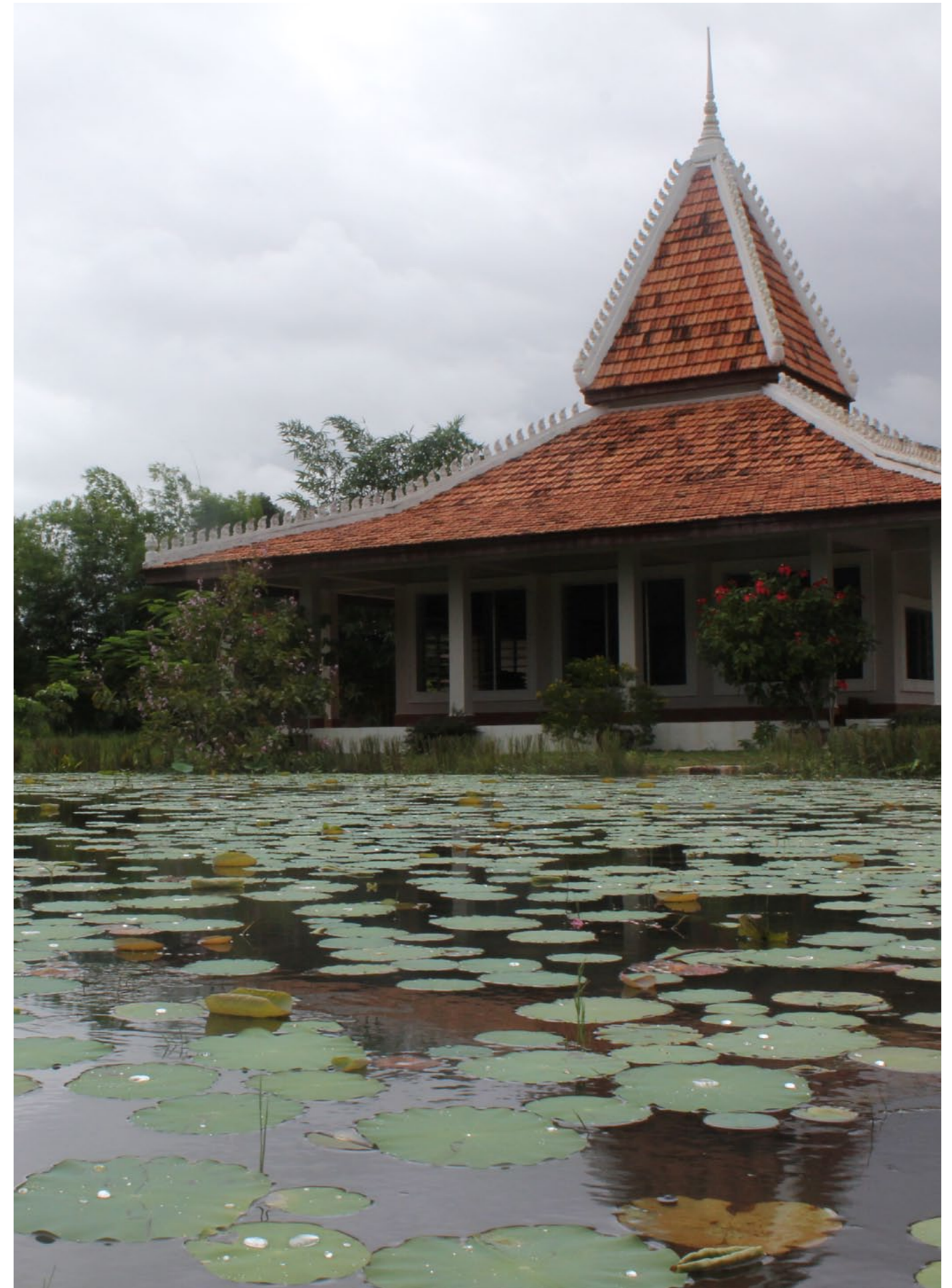
The chapel and lilly pond are but one part of the Meta Karuna reflection centre in Siem Reap, Cambodia.