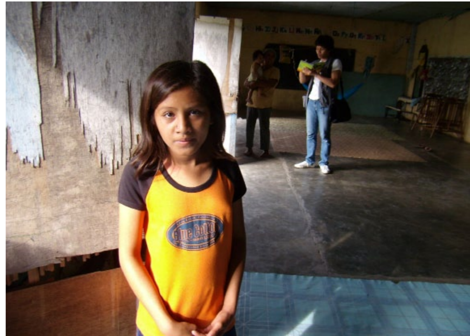
A young girl from the Philippines stands in her home.

We’ve be shaped by our accompaniment. So many refugees endured privation and unholy abuse before escaping to seek a dignified life. They faced the perils of drowning, brigands, and landmines. They endured years of uncertainty in camp conditions. In their quest for something nobler for themselves and families, they suffered the anguish of leaving home, loved ones and the familiar.