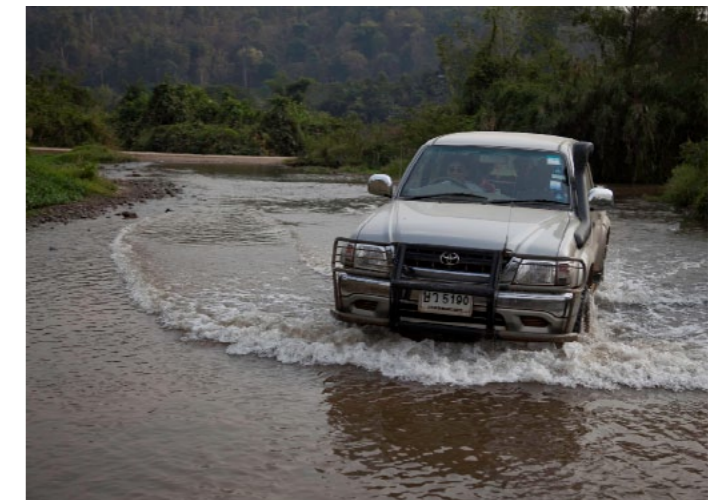
A JRS truck on the way to Bam Mai Nai Soi camp in Mae Hong Son.

in Europe — “she would have no opposition” (Acts 16:15) — all point to the centrality of the New Testament law, to love one another as I have loved you, not contradicting but building upon the Deuteronomical injunction to love the stranger (Dt 10:19). Offering hospitality to strangers is not always a natural instinct, if we reflect on the current outbursts from politicians and opportunists who rail against the threat from outside, the danger from overseas, problem of the stranger-in-our-midst, the security risk from the foreigner, the menace of the Muslim, the spread of the terrorist. Modern discourse even at times seems to contradict the very value of spontaneous and natural offering of hospitality and accompaniment, argu-