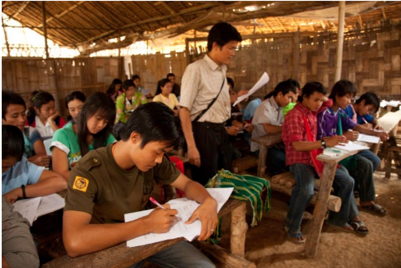
Secondary school classes in the Ban Mai Nai Soi Camp in Mae Hong Son, Thailand.