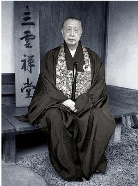
Zen Master Koun Yamada